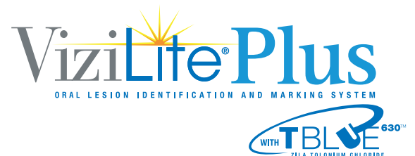
MARKED WITH TBLUE 630